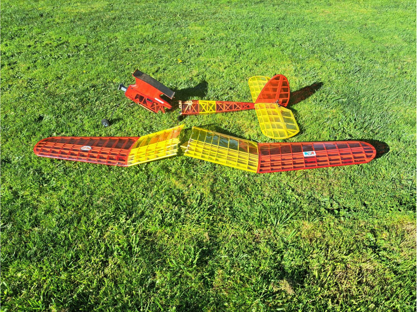
Above – the broken Lanzo Bomber