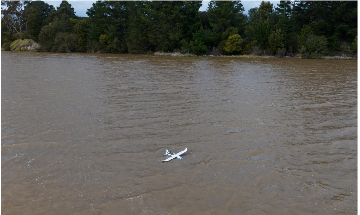
Above – Doug’s Bixler blowing away

Gliding Day at No Pine – Sunday 17 th September – It was a very windy day from the start with the gusty Westerly wind blowing 32kmh to 46kmh so I doubt anyone would have gone up to the site. I did hear that a couple of experienced members flew at Lake Narracan.