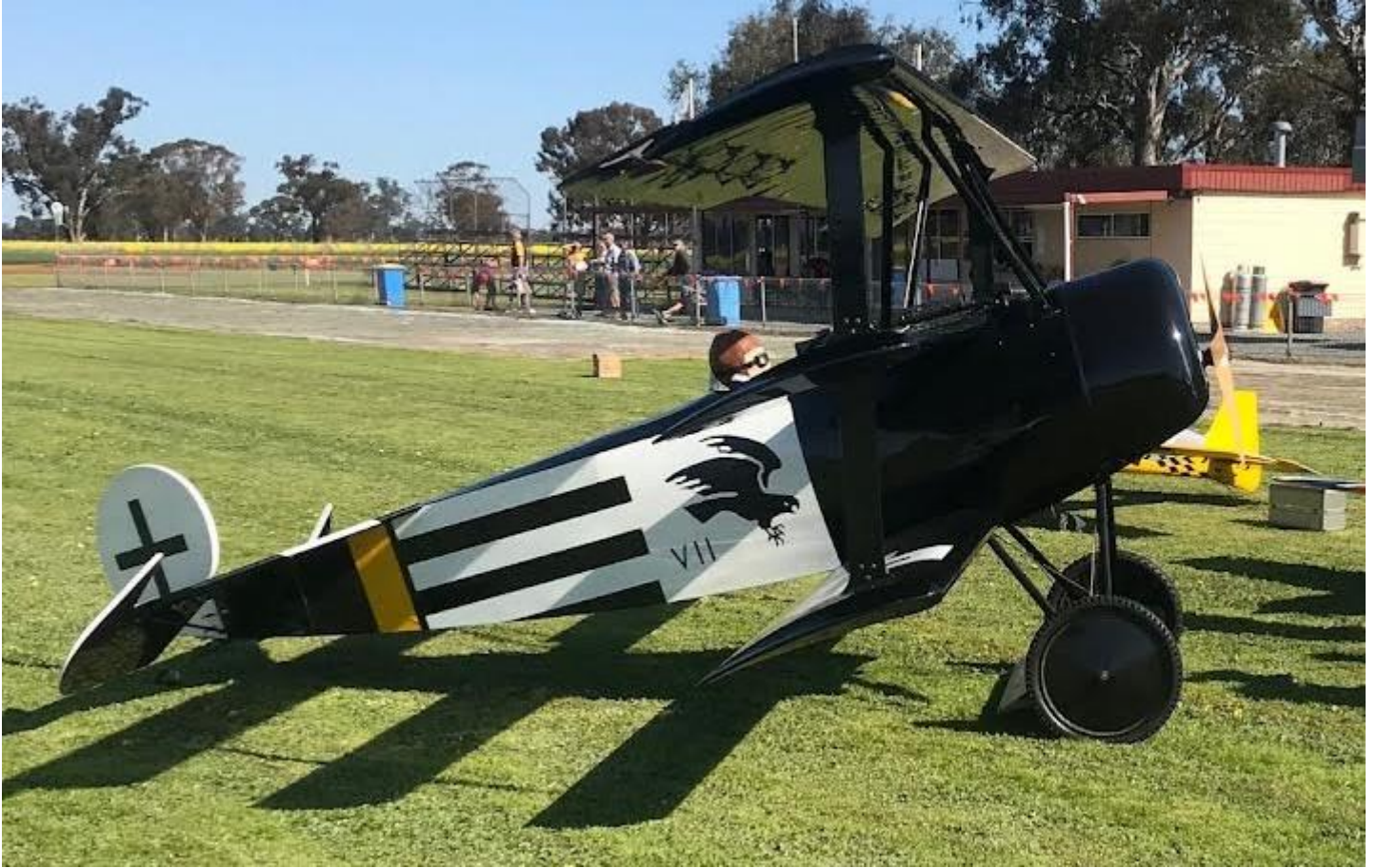
Above - A Giant Scale Fokker DV11