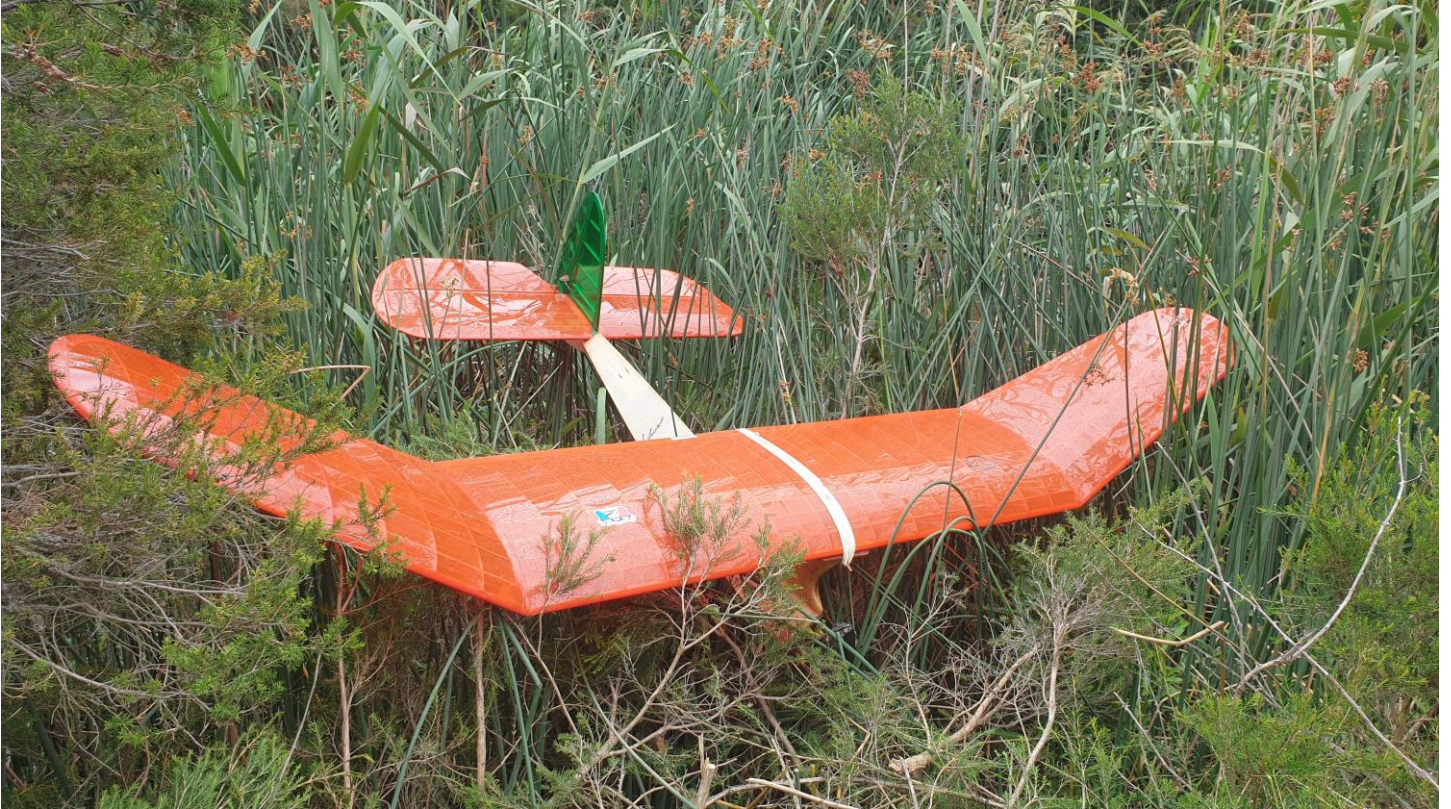
Below – the track Don cut to get in & Above – the undamaged Model