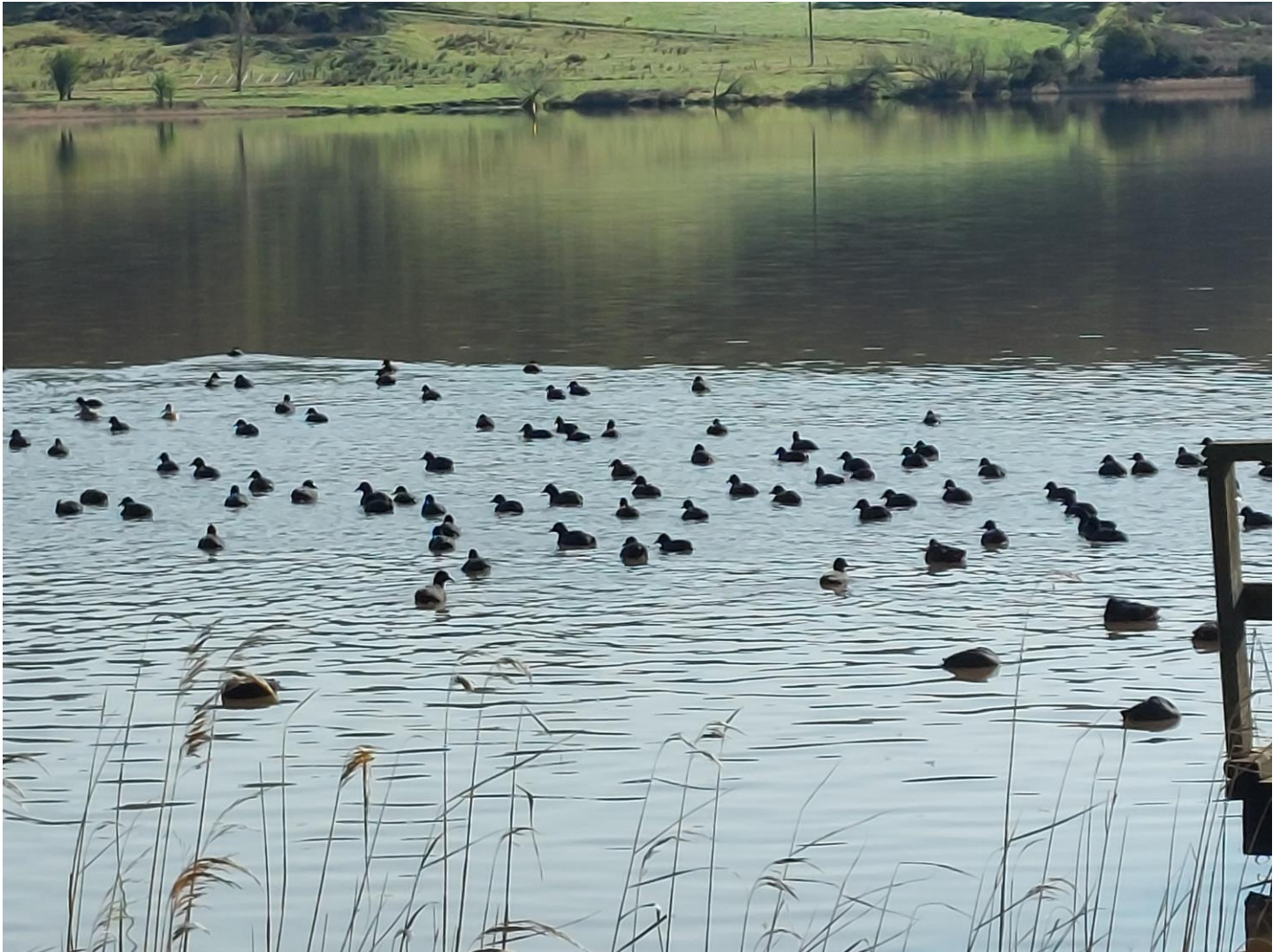
Above – one Thursday with very nice weather, we had visitors on the lake. It wasn’t really “weather for Ducks”. Maybe they knew it was Duck hunting season and that Lake Narracan was a “Safe Haven.”