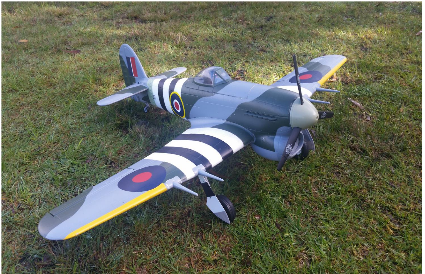
Above – The Typhoon was an interceptor/ground attack plane, good in both roles,. The Bairnsdale Club are having a Warbirds weekend on 4 th & 5 th November and it should be a good weekend if the weather is good.