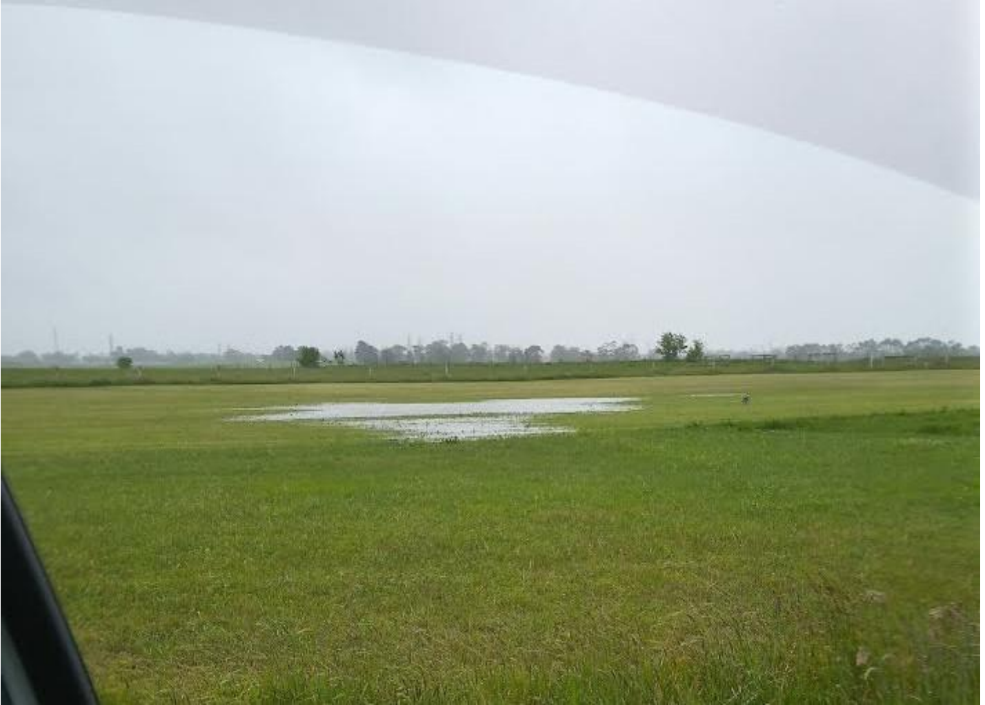
Above -The strip on Friday 13 th October. The water was gone by Sunday so the drainage must be working but the ground was still quite soggy.

The Combat Classic Event 4 was also postponed as Sunday 22 nd October was a very windy day with the wind gusts up to 65kmh. An 80kmh gust was recorded to the LV Airport. So the next and final Combat Classic event for this year will be on Sunday 29 th October 23 at 11.00am if the weather is suitable. If the weather is not suitable we will try for Sunday November 12 th .