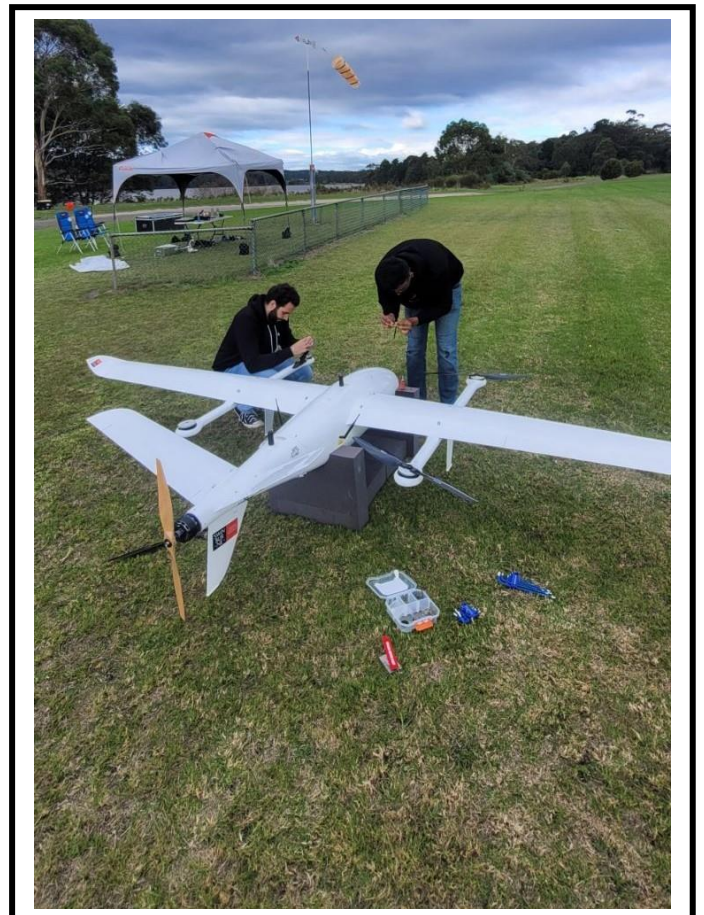
above – Members of the Swinburne Air Hub preparing the 3.6m span Drone for flight at Lake Narracan.

Present your Club Card for your 10% discount.