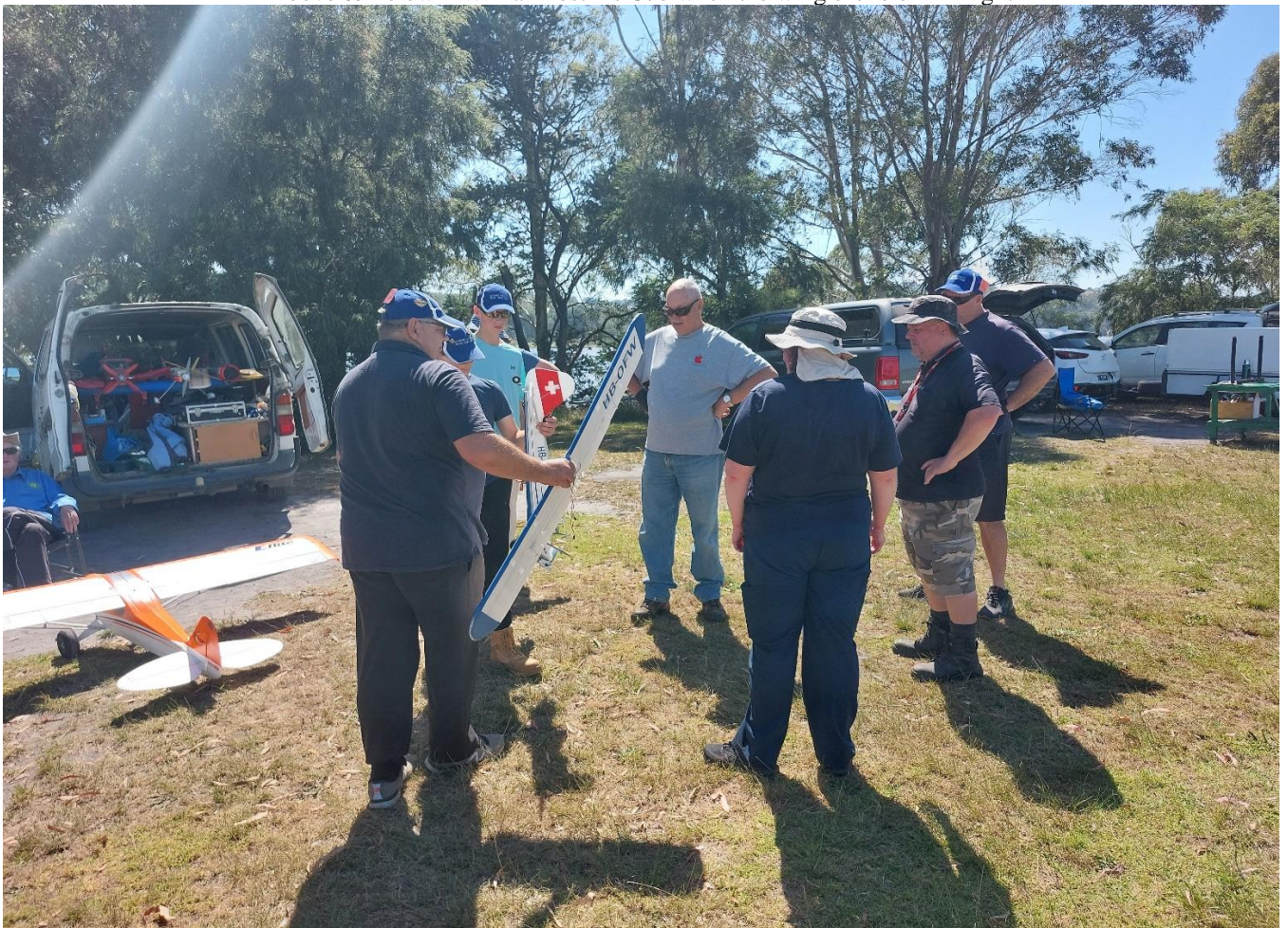
Above – members discussing what happened