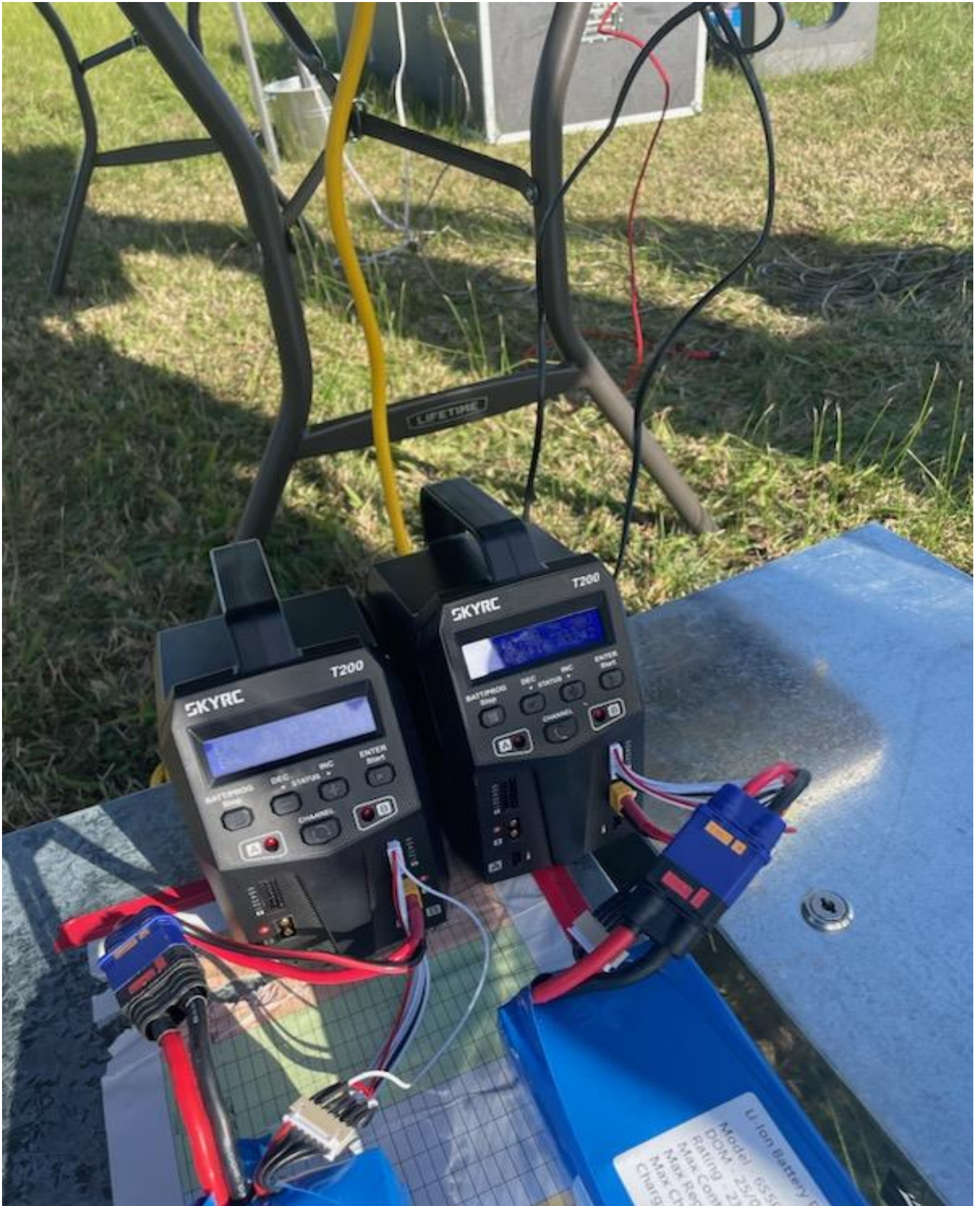
Above – two of the drone battering charging on a generator

Have you got the correct Wings ? Several members have “Bronze Wings” and should be upgrading to “Silver Wings” or even “Gold Wings. Don’t be afraid to have a go at the manoeuvres, especially when you may be the only one in the air. It can only make you a better pilot. There is more to flying RC than just flying around in circuits.