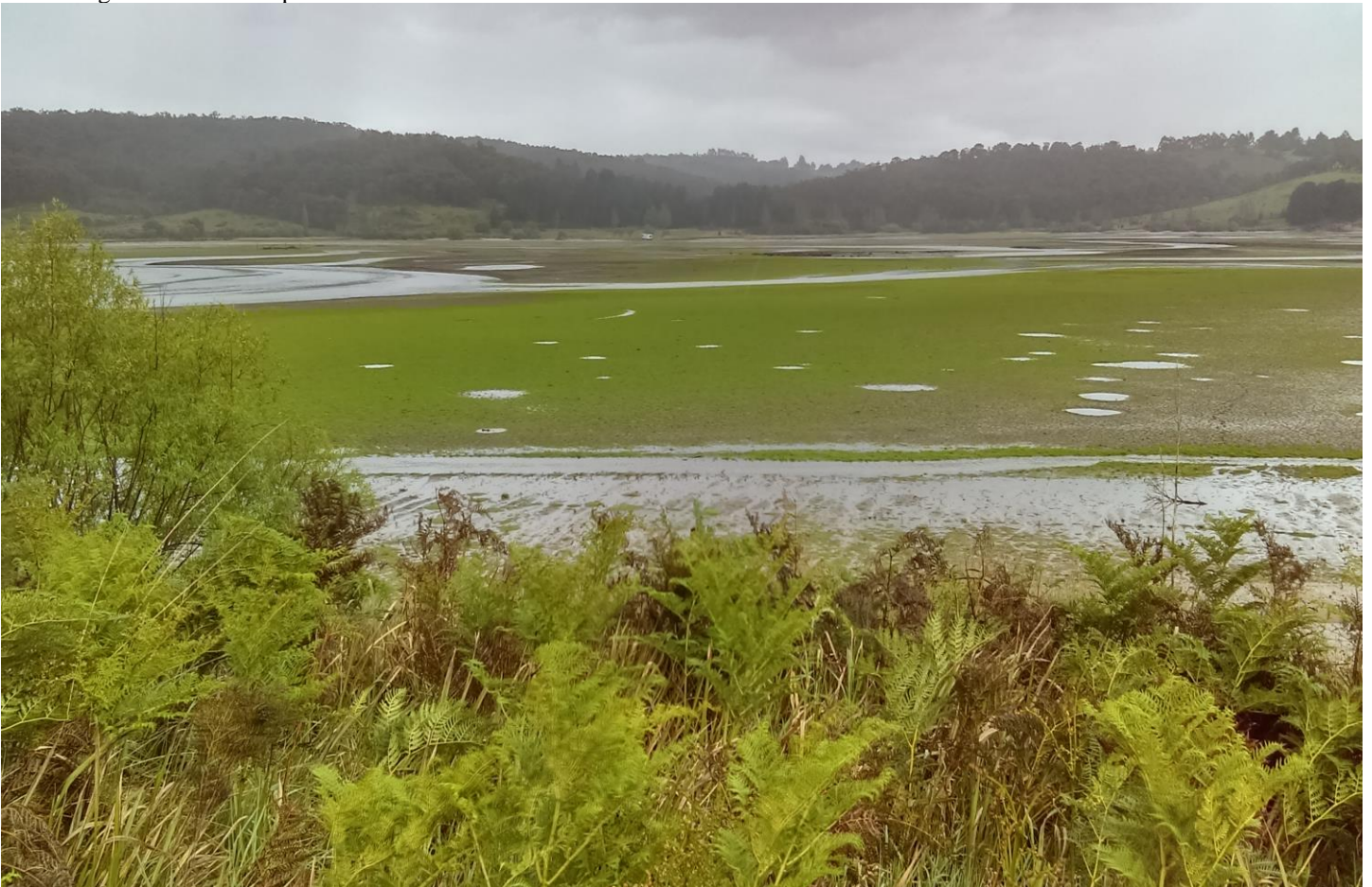
Above – Godwin showed this Pic of Lake Narracan when it was empty a few years back. It's amazing just how quickly the grass grows on the mud. There is normally 1.2m to 1.8m of water over this area.