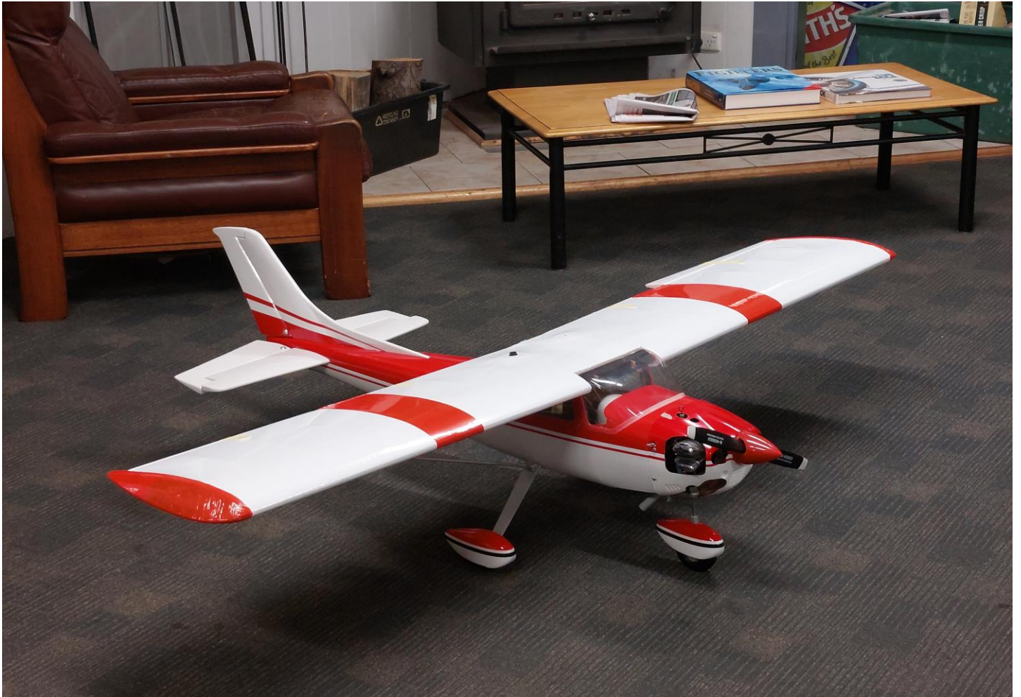
Above– Rex Mitchell’s show & tell – Cessna Fuselage with the wing off another model