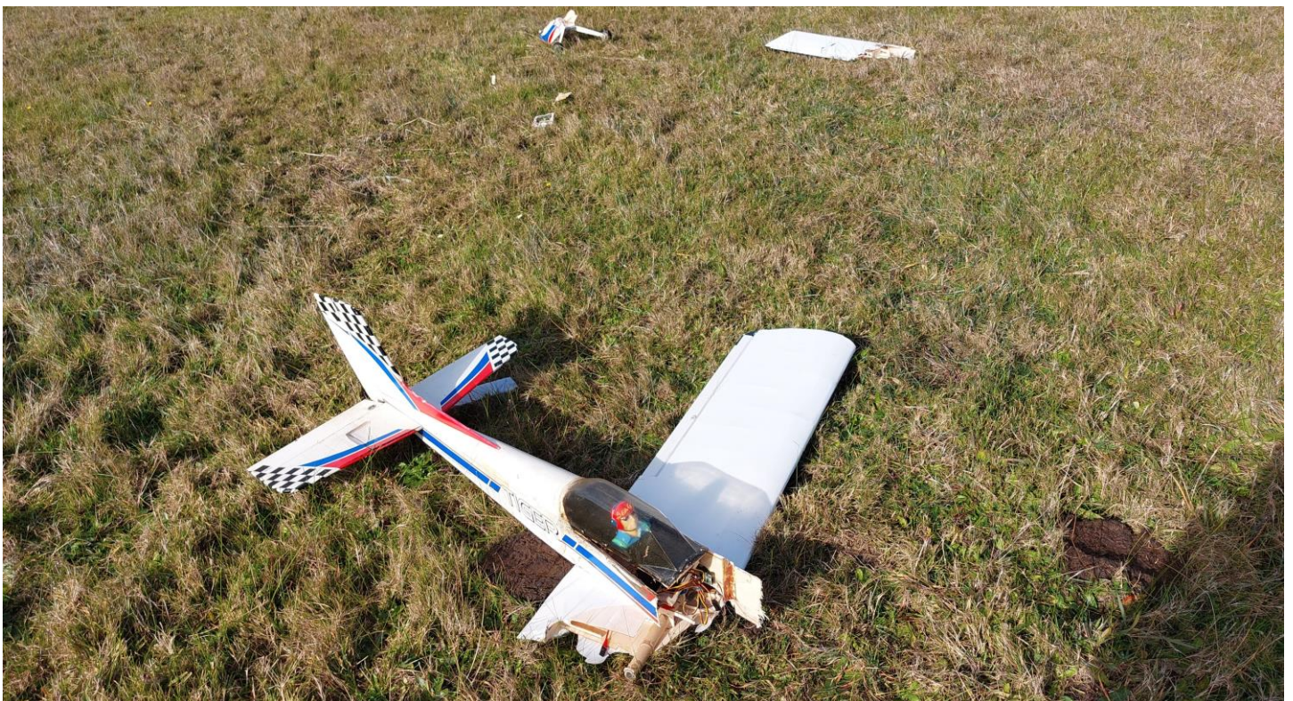
Above - Fred Walder's Tiger had engine problems and crashed

Roy has also left some Glow Plugs and Ply wood in the Container at marked prices.