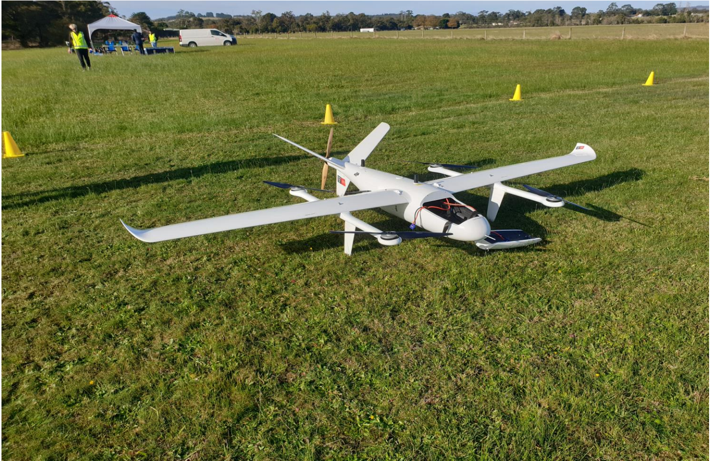
Above – The Swinburne Drone

They have 2 Drones, one flying on batteries and the other on Hydrogen. The Drones have a 3.6 m wingspan and the battery powered one flies on 4 x large Lithium Li-ion batteries, each weighing 10Kg. It also has a 10KG payload so it's all up weight would be over 70Kg.