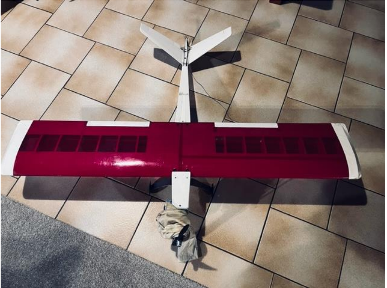
Stik – OS46 engine 1.2m wingspan - $100