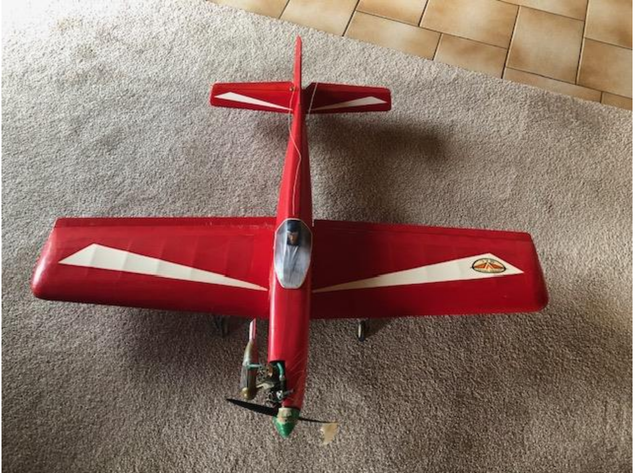
Pizazz Floatplane – OS 46 engine 1.3m wingspan - $100

Valley Flier – OS46 Engine – Kraft servos – Wingspan 1.2m – ROM air retracts – ready to fly - $100