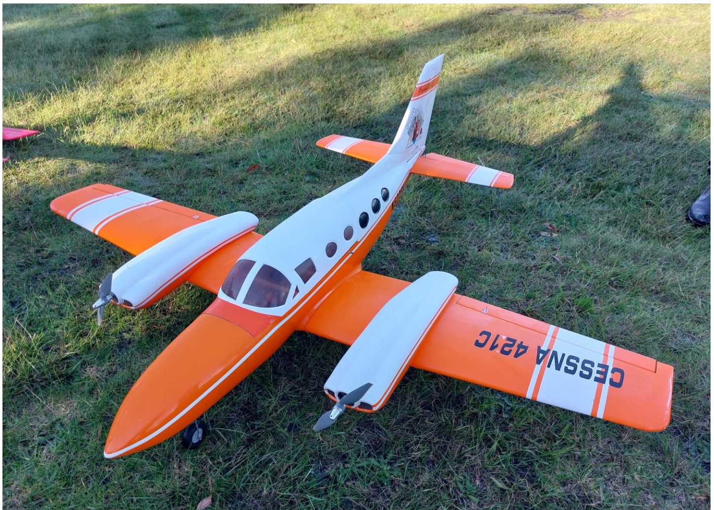
Wayne was going to fly his Cessna 421 at the Bairnsdale Mid May Muster but that didn't happen, but it did fly at Lake Narracan the following week. 2 x G46 motors , 2x 5S 5000Mah batteries in parallel. 6kg flying weight.