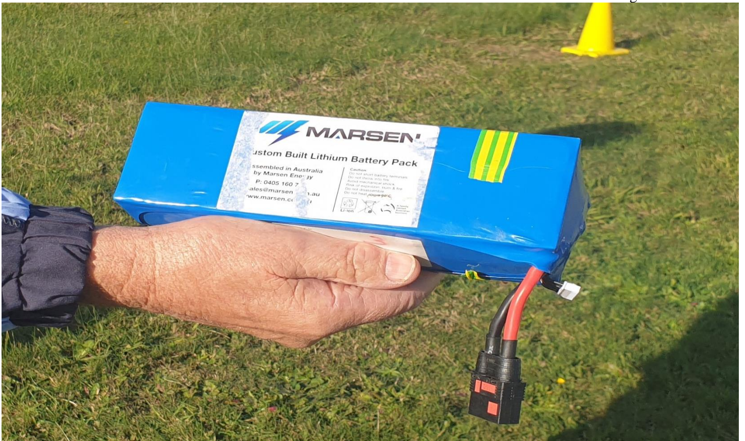
Below - one of the 10kg Drone Batteries