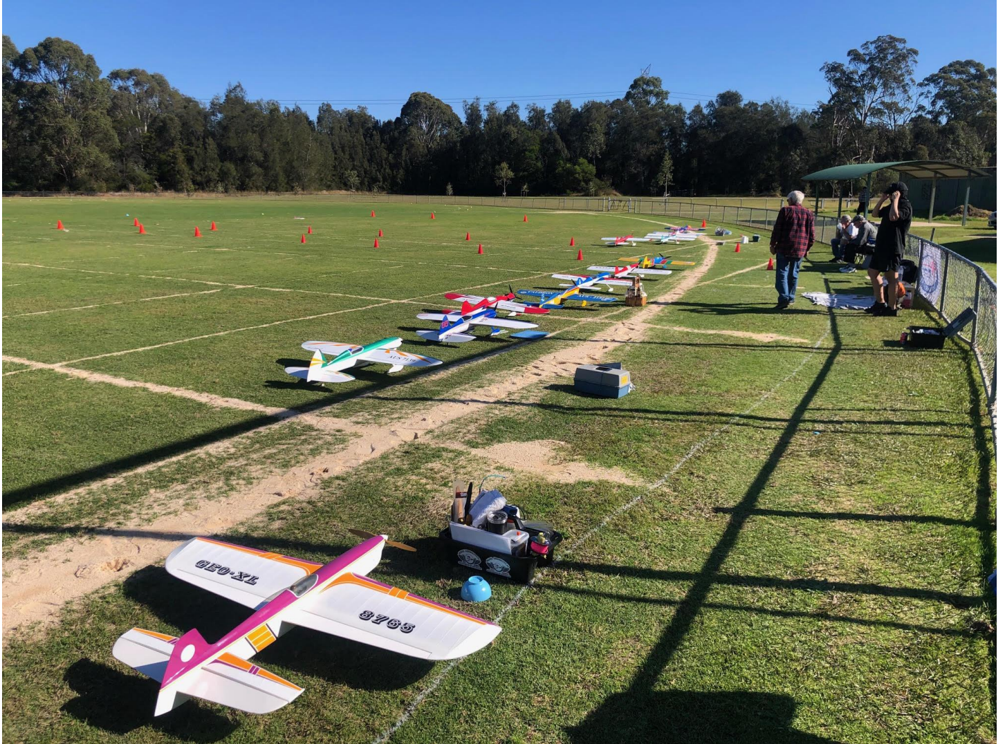
Above - the CL flight Line at Doonside in Sydney