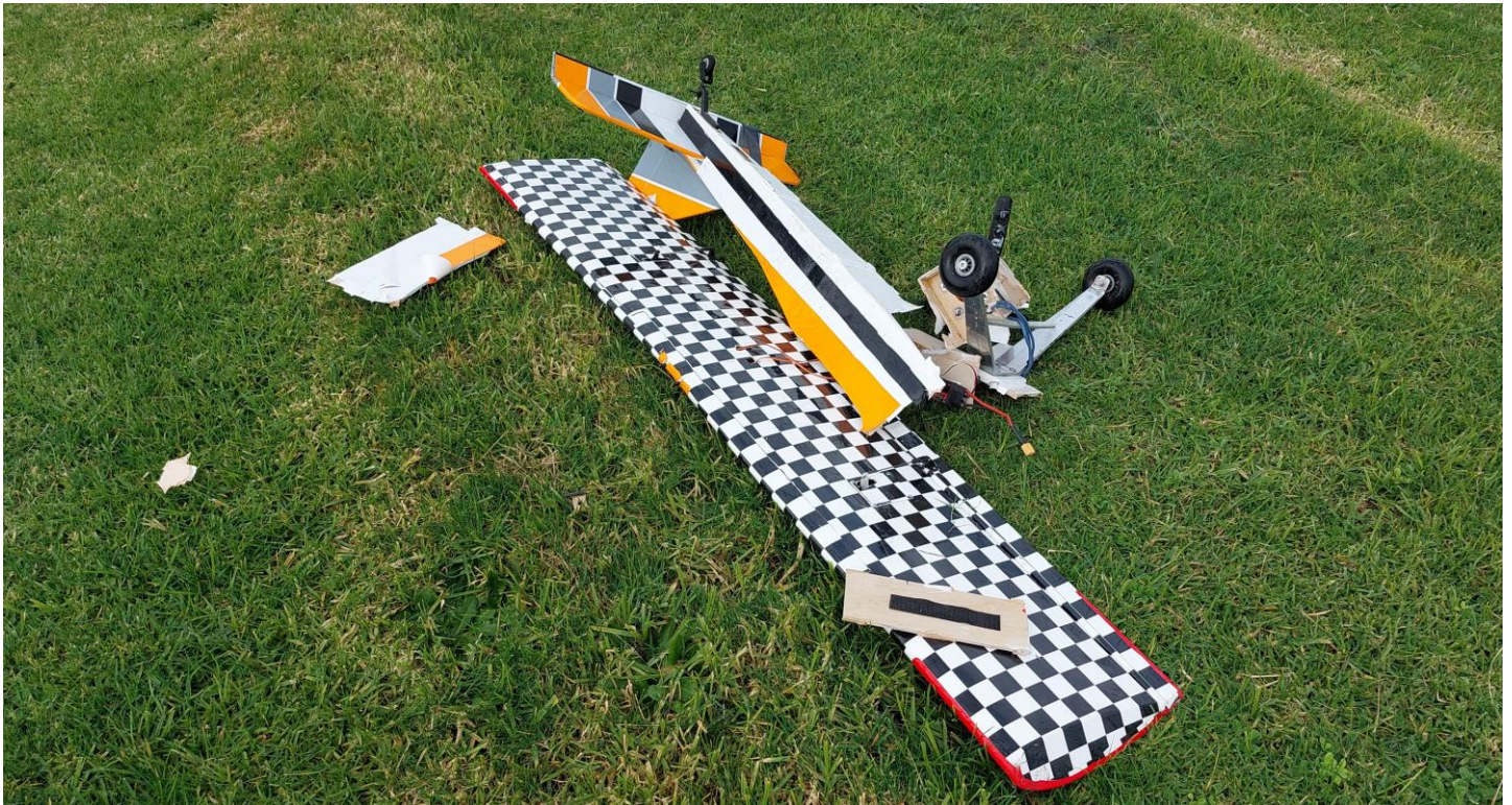
Above – Ivan's Jackaroo got caught with the wind on a touch & go which became a touch & crash.

http://www.maaa.asn.au/images/pdfs/forms/Form-016-POWER-BRONZE-SILVER-WINGS.pdf