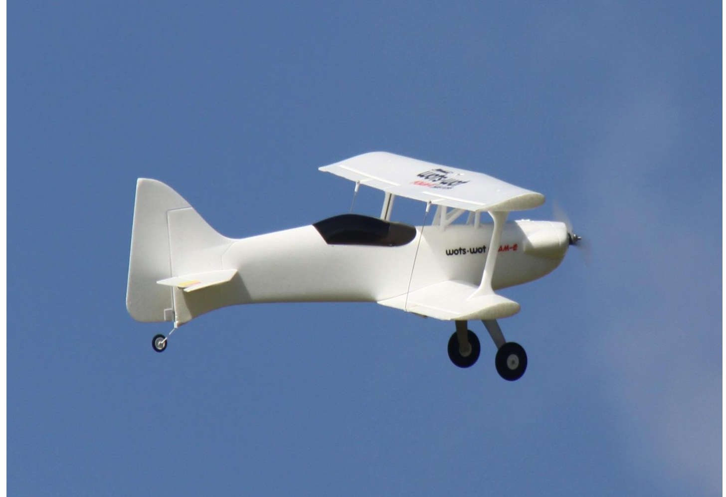
Above – Lofty's Wots-Wot Foam E