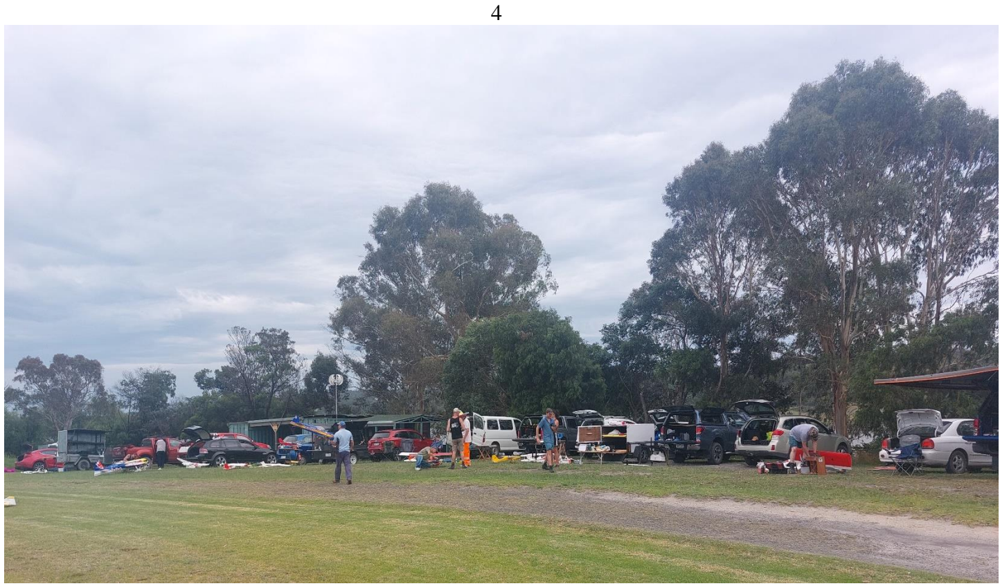
Above – it was a busy fly day