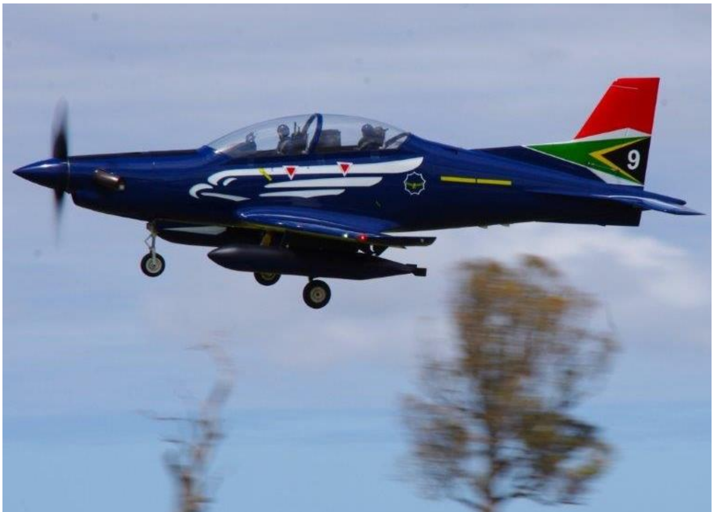
Turbine powered Pilatus PC 21 in South African PC 7 colour scheme on a flypast at the Bairnsdale Warbirds Event