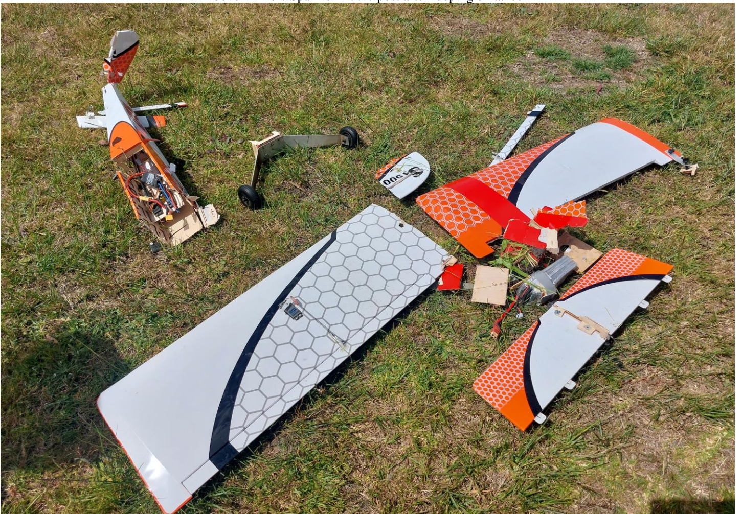
Above – Wayne's new S1500 Stick had the wing spar break in flight. He had been kind of wringing it out on a very windy day.