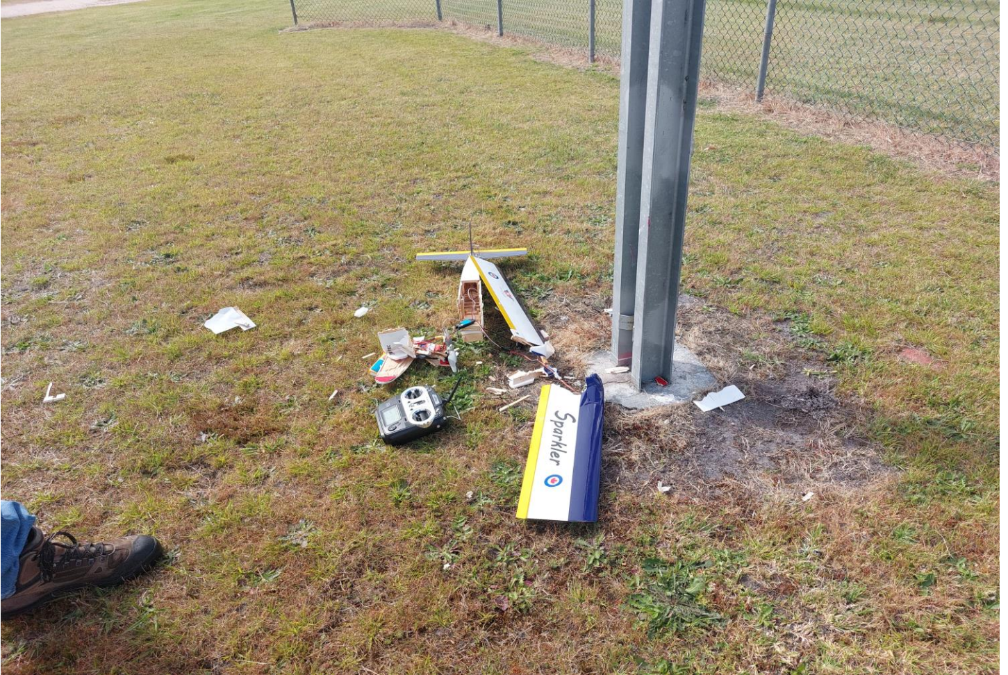
Above – Eric's Sparkler hit the post after looping on takeoff