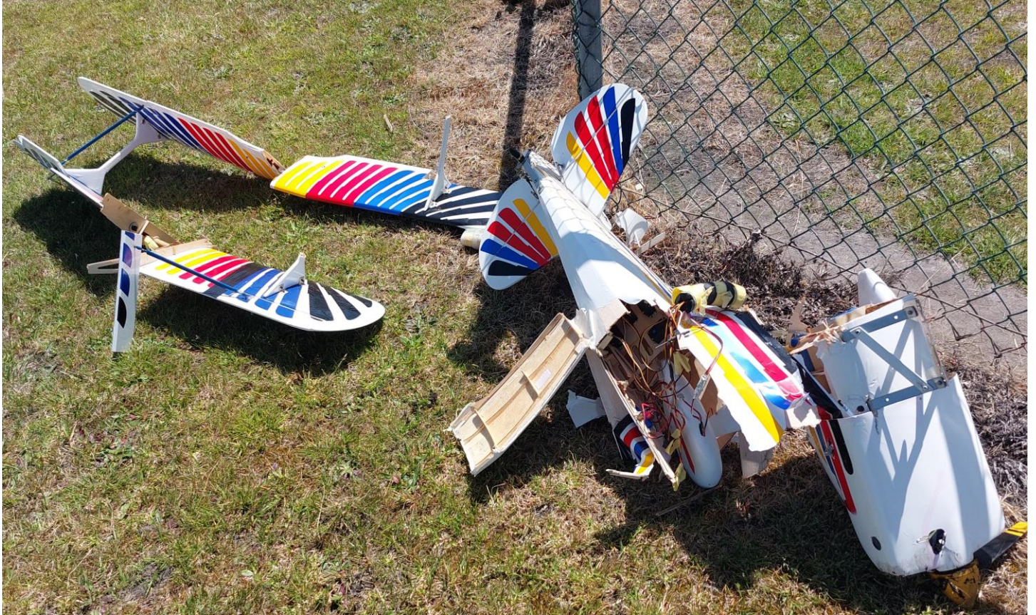
Above – This Eagle has well & truly landed