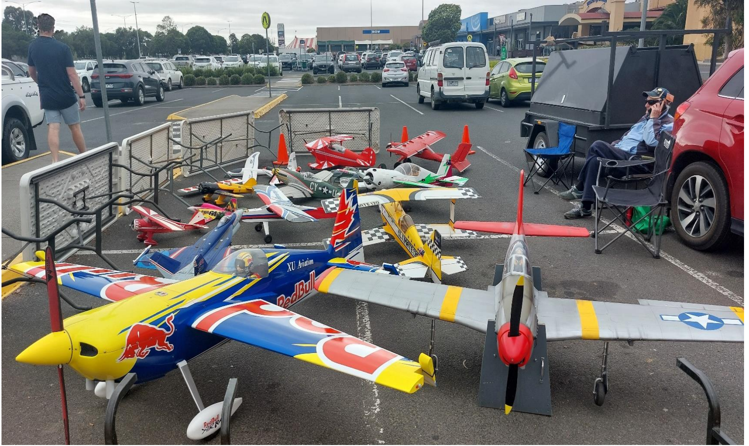
Above- our display - looking East