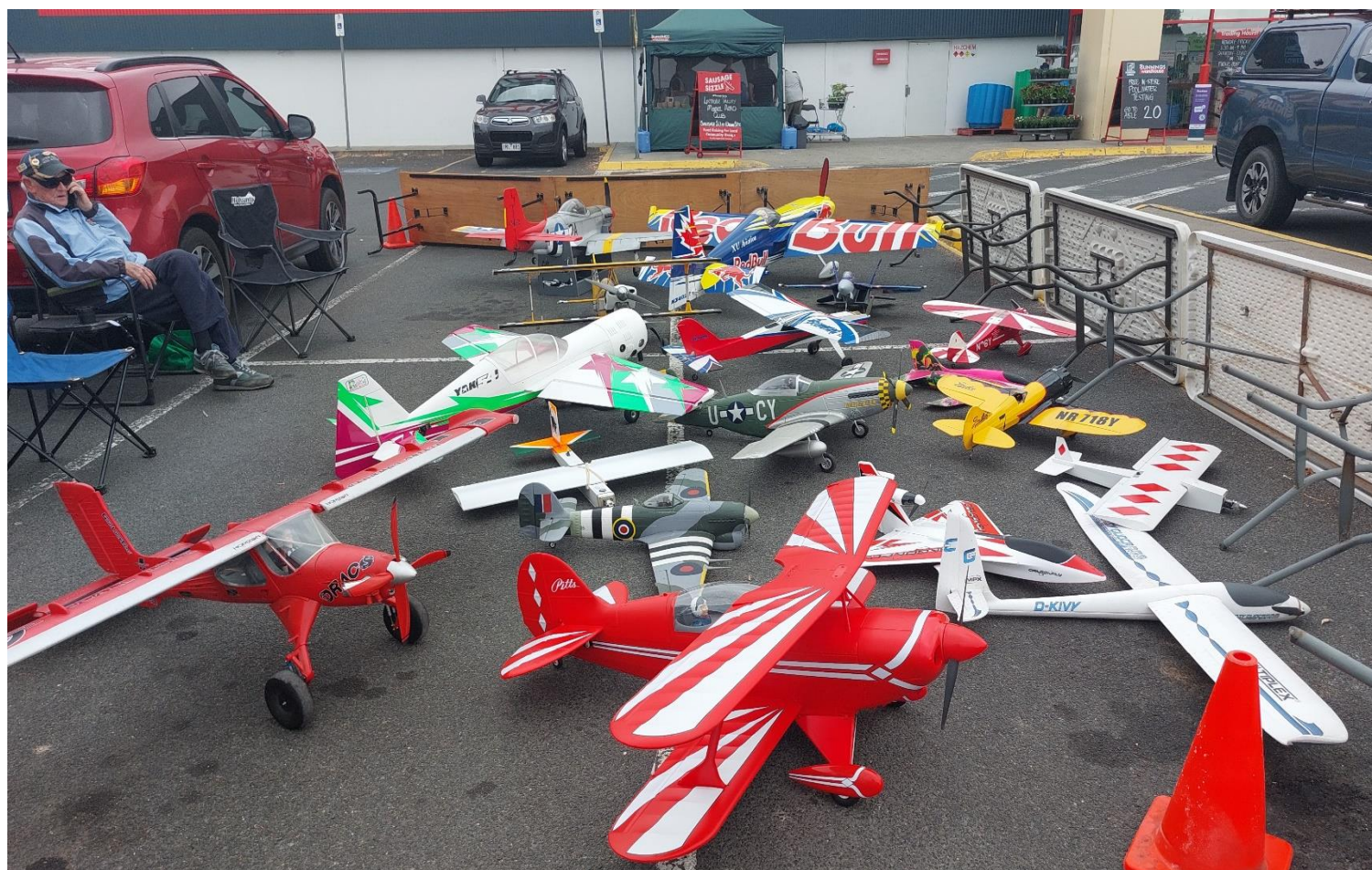
Above – our display - looking West

There was a lot of public interest in the models and several people have indicated that they are going to come and have a look at the field on a good day so it was a good PR exercise for the club.