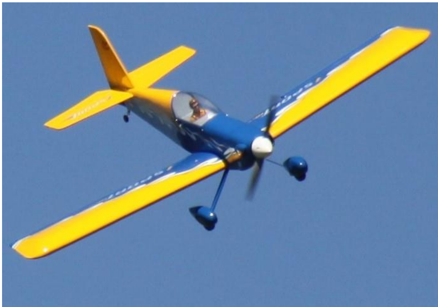
Glen Neal's Seagull Model "Dolphin" in flight

It's a large electric model and flies well.